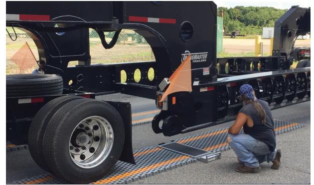
The LS630-WIM™ System is the most efficient means to weigh multi-axle truck/trailer combinations, recording up to 36 individual axle weights per vehicle.

Regardless of space constraints or load size, Intercomp offers a variety of precision weighing solutions that can help heavy-haul professionals complete their job more efficiently. Whether reducing undue strain to transportation equipment, or ensuring wheel/axle weight compliance and safe operation, our line of low-profile scales can help grow your bottom line by reducing unplanned expenses.