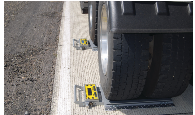
LP600™ scale pads have set the standard for portable axle scales in the heavy-haul industry due to ease of use and quality construction.