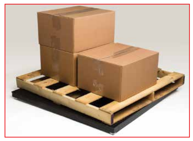
6600 mild steel model pictured.

The parts and components of these Pennsylvania Scale Company products are warranted for five years from the date of retail delivery against defects in materials and workmanship, subject to the terms and conditions of our standard warranty.