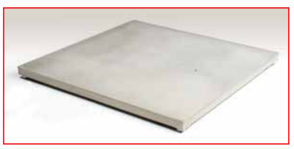
Optional stainless steel construction and load cells provide excellent utility in harsh or wet applications and meet USDA standards.