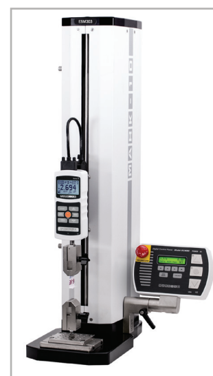
Shown with an ESM303 test stand and G1061 wedge grips

Series 5 gauges include MESUR™ Lite data acquisition software. MESUR™ Lite tabulates continuous or single point data from Series 5 gauges. Data saved in the gauge's memory can also be downloaded in bulk. One-click export to Excel easily allows for further data manipulation.