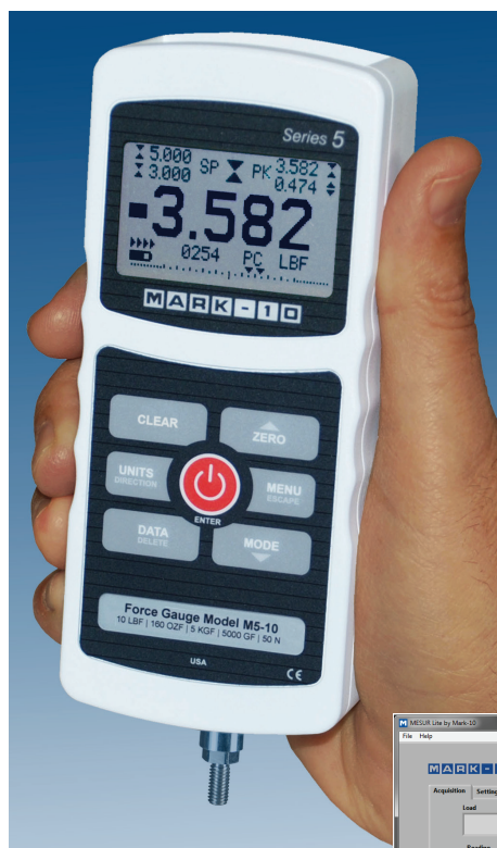
MESUR™ Lite data acquisition software is included with Series 5 gauges