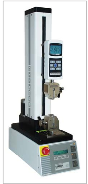
Shown with an ESM301 test stand and G1061 wedge grips

Series 4 gauges include MESUR Lite data acquisition software. MESUR Lite tabulates continuous or single point data from Series 5 and 4 gauges. Data saved in the gauge's memory can also be downloaded in bulk. One-click export to Excel button easily allows for further data manipulation.