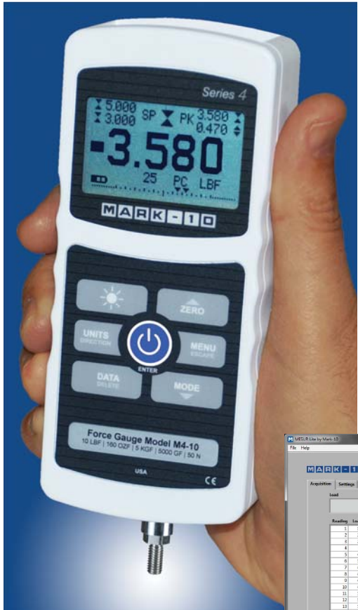
MESUR Lite data acquisition software is included with Series 4 gauges