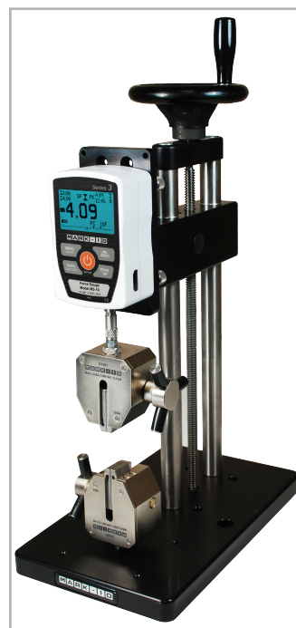
Shown with an ES20 test stand and G1061 wedge grips

The gauges include MESUR Lite data acquisition software. MESUR Lite tabulates continuous or single point data. One-click export to Excel allows for further data manipulation.