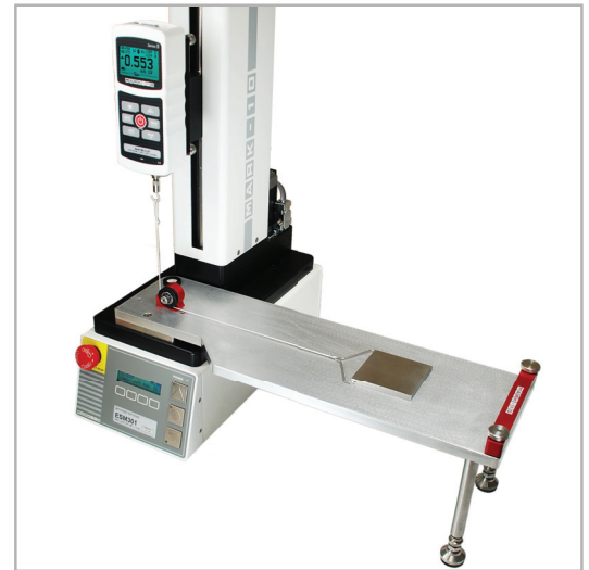
Shown with an ESM301 test stand and G1086 COF fixture

The M5-2-COF may also be used for a number of common tension and compression testing applications. The gauge is based on Mark-10's Series 5 advanced digital force gauges, and includes the series' full set of functions and settings.