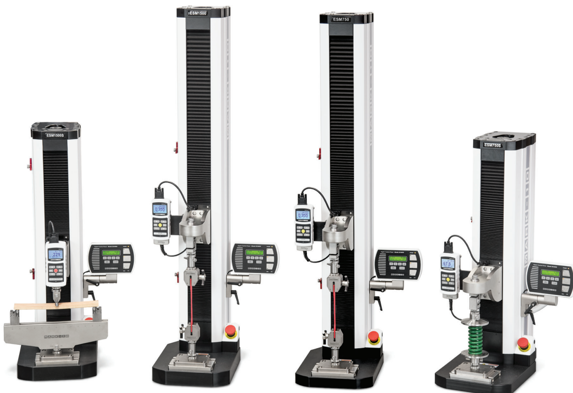
ESM1500S 1,500 lbF [6.7 kN] 14.2 in [360 mm] travel