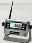
MSI-8000 HD LCD RF Remote Display