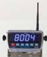
MSI-8004 HD LED Remote Display